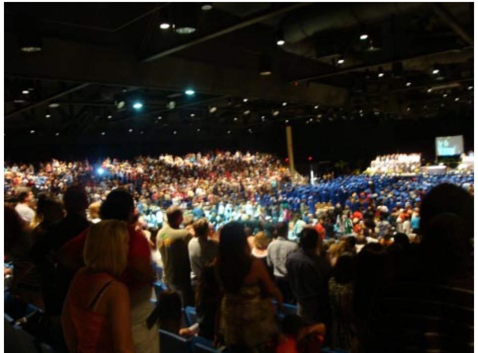
Family members watch as MTI Class of 2012 transition from students to alumni.